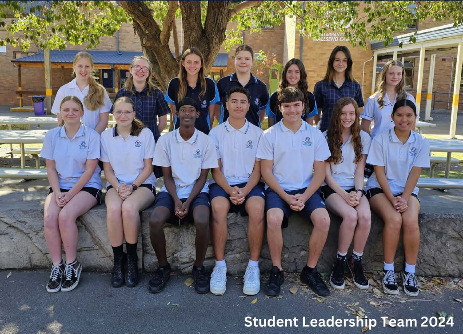
Student Leadership Team 2024