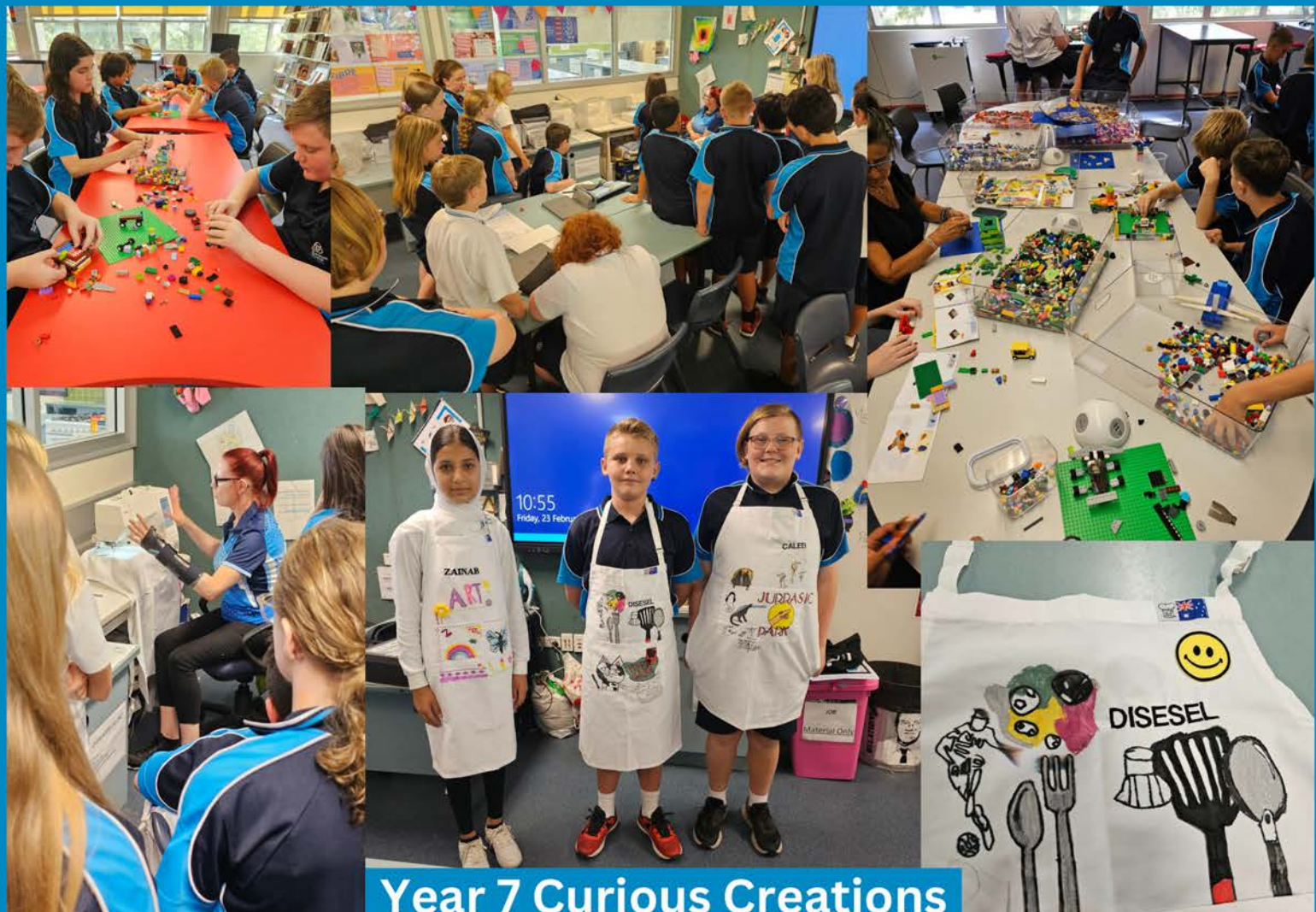
Year 7 Curious Creations